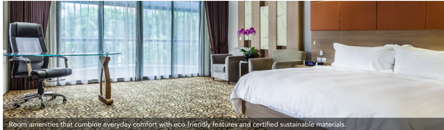
Room amenities that combine everyday comfort with eco-friendly features and certified sustainable materials.

The Tanglin Club recognises that stewardship of heritage must go hand in hand with stewardship of the environment. Across its operations, the Club has embedded practices that reduce impact and encourage responsibility: eco-friendly production methods for branded merchandise, recycled materials wherever possible, and a commitment to reduce single-use plastics. Food and beverage outlets are aligned with sustainable sourcing principles, while facilities adopt energy-efficient systems that lower carbon emissions.