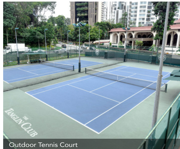
Outdoor Tennis Court