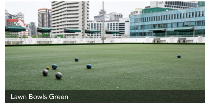
Lawn Bowls Green

Every space has been sustained through continuous renewal, ensuring relevance without loss of character. These amenities are not conveniences; they are settings where Members experience continuity, celebrate milestones, and live the cadence of their daily lives within the Club.