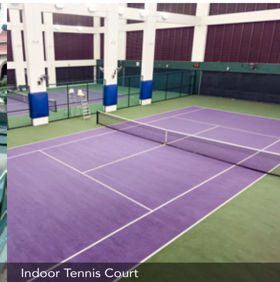
Indoor Tennis Court